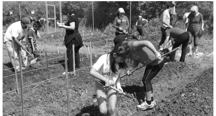
Volunteers plant garden in May