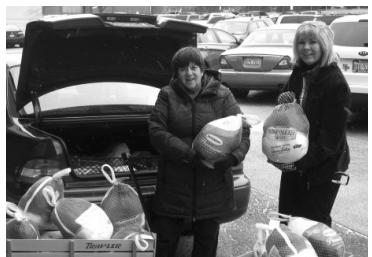
A team of volunteers and engaged local businesses make our Food Pantry a true community project