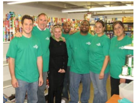
National City Bank Volunteers Pause to Pose at Food Pantry