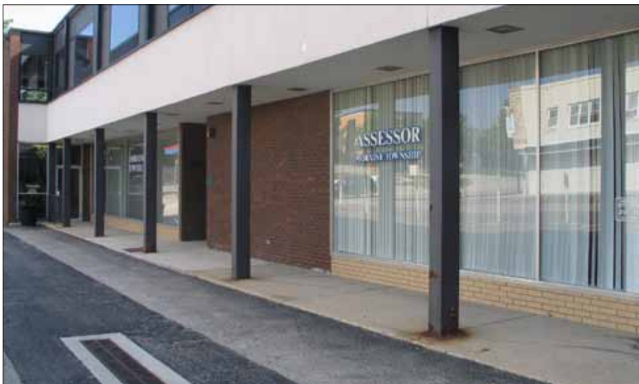
Plenty of free parking at 777 Central, Highland Park

Please contact our office with any questions about exemptions, assessments and your property record card. We are here to serve you. ■